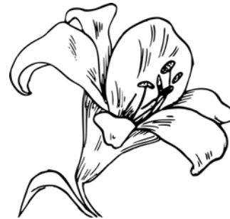
(Puzzle on Pg. 19)