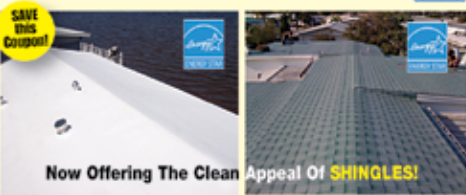
Now Offering The Clean Appeal Of SHINGLES!

Please be sure you are dealing with a Florida Certified Licensed Contractor ... AND DON'T BE FOOLED BY NEW COPY-CAT COMPANIES WHO HAVE STARTED USING OUR GOOD NAME! PLEASE CALL THE ONE AND ONLY: