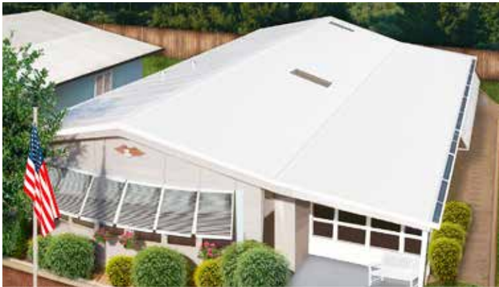
The AMS Patented Insulated WEATHER-LOK ROOFOVER SYSTEM

Serving South Florida with Excellence for Over 40 Years!