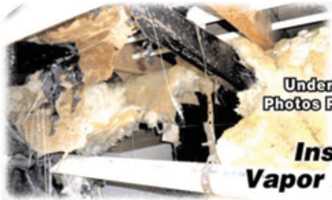
Underhome Photos Provided

Insulation Under Your Home Falling Down? Holes and Tears in Your Vapor /Moisture Barrier?